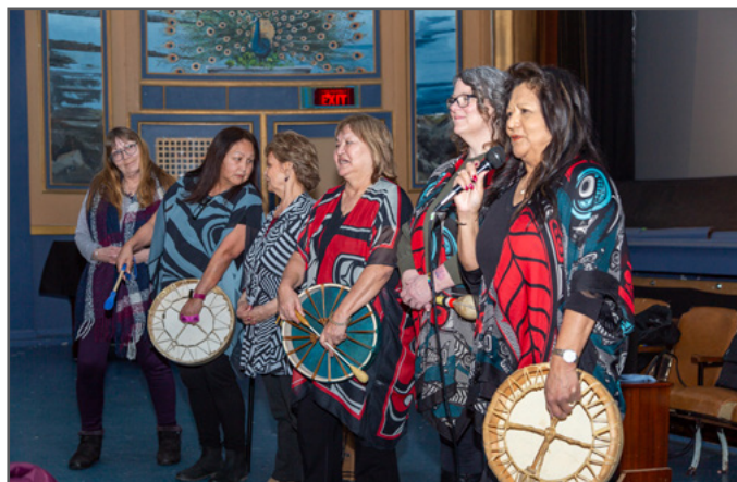
Tla'amin Spirit Singers regularly open the film festival with traditional songs.

The Festival has a sponsorship level to suit your business needs. All of our sponsors have their names or logos featured in our Festival Guide, on our website, and displayed on the silver screen before all Festival films.