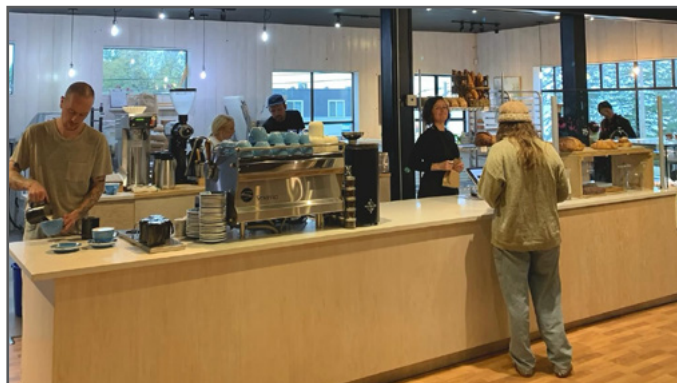
32 Lakes Café & Bakery has been an in-kind sponsor of our popular Morning After Film Salons, providing delicious baked goods.

In-kind sponsorships are a valuable way to support the arts, not with dollars, but with products and services. In-kind sponsorships have a significant impact on the bottom line of the Film Festival. If you or your company offers a service or product you feel we might need, please let us know.