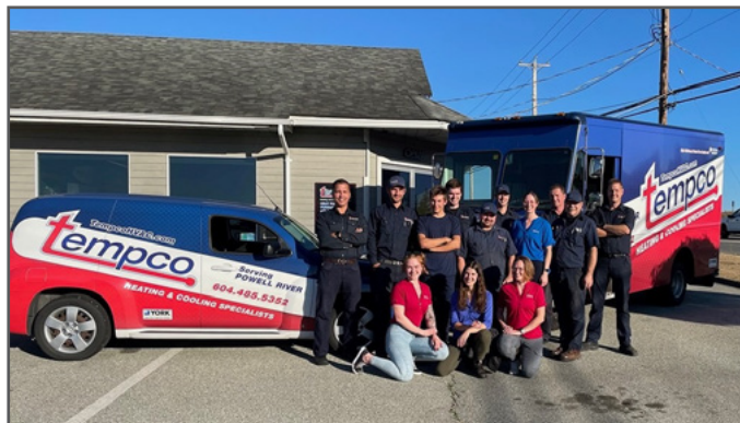
Tempco has been a Platinum Sponsor of the film festival for the last 3 years.

By supporting the qathet international film festival through sponsorship, your business can help us fulfill our objective to deliver programming that enriches and engages our audience in critical dialogue. Support can take the form of cash or in-kind donations of goods and services.